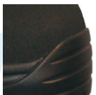
Toe Cap Protection