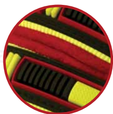
SHELL-GRD® on fingers