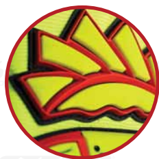
SHELL-GRD® on back