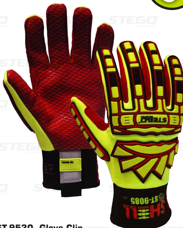
ST-9530 Glove Clip Shell Series Gloves comes with Glove Clip accessory