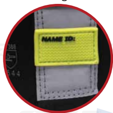
Hi-viz ID badge