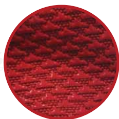
SHELL scale grip