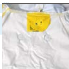
Ventilated cape back