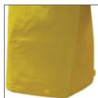
Plastic snap button on cuff sleeves