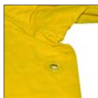
Ventilated cape back & underarms