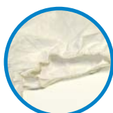
Elasticized face opening