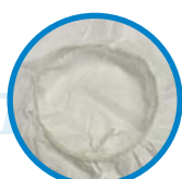
Elasticized neck line