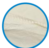
Serged seams finished